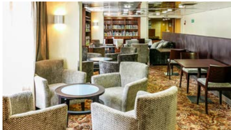
The Compass Club/Library