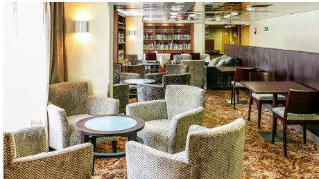
The Compass Club/Library