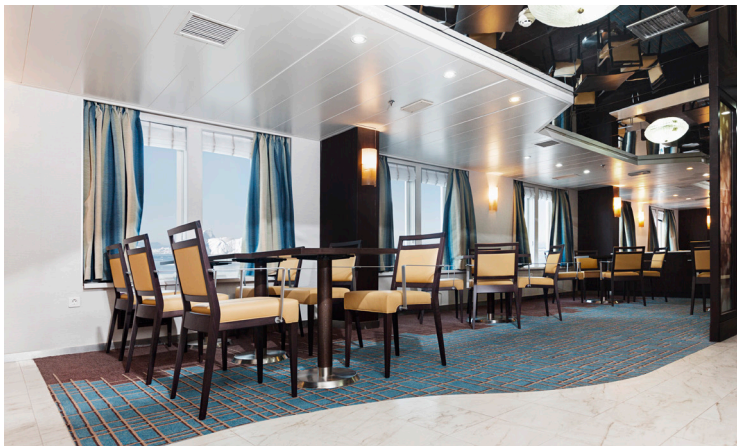
Coffee Bay & Library